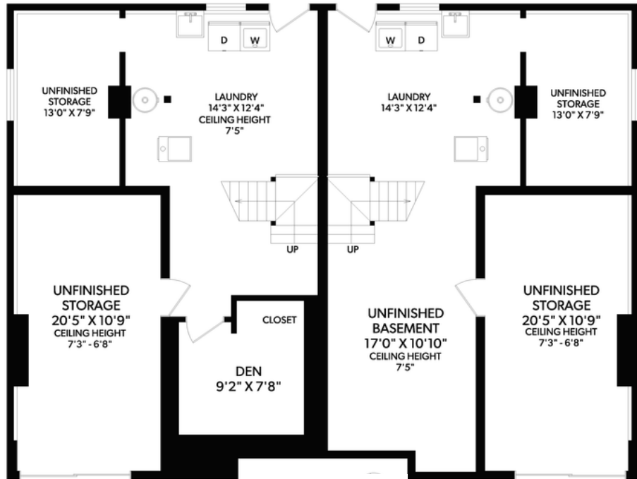
915 LOWER FLOOR