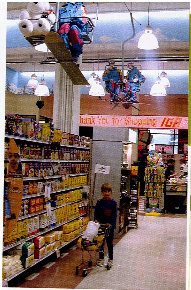
The profitable IGA in Whistler, B.C., makes mundane grocery shopping more fun with its ski theme and child-sized carts.

According to Intrawest officials, sales by their "casted" retail tenants—those they have worked with closely to determine the types of experiences customers will take away—have steadily increased during the last five years with average annual sales well over $500 CDN (about $325 US) per square foot with some exceeding $1,000. That number is on a par with the most successful shopping centers in North America, and yet Intrawest is continually refining its retail model. Similarly, Vail Resorts has seen retail and restaurant sales at Beaver