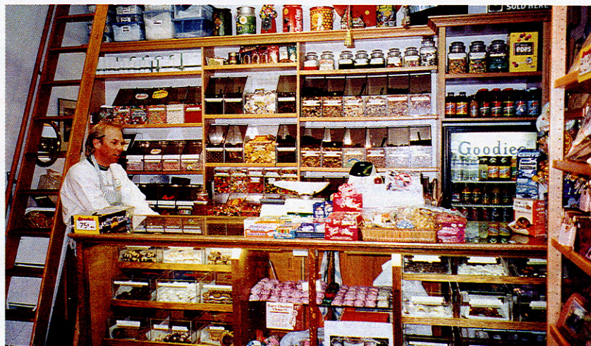
The General Store in Lake Louise, Alberta, appeals to a sense of nostalgia in its design and keeps its shelves stocked with items aimed at satisfying customers looking for instant gratification.

The survey showed no clear relationship between the amount of retail space at a resort and its skier visit numbers, capacity or the number of condo and hotel units surrounding the mountain. In the past, the assumption was that these factors should determine space dedicated to retail, but early numbers from retail projects developed or repositioned by the likes of Vail Resorts, Intrawest, American Skiing Co. and Booth Creek Resorts have shown