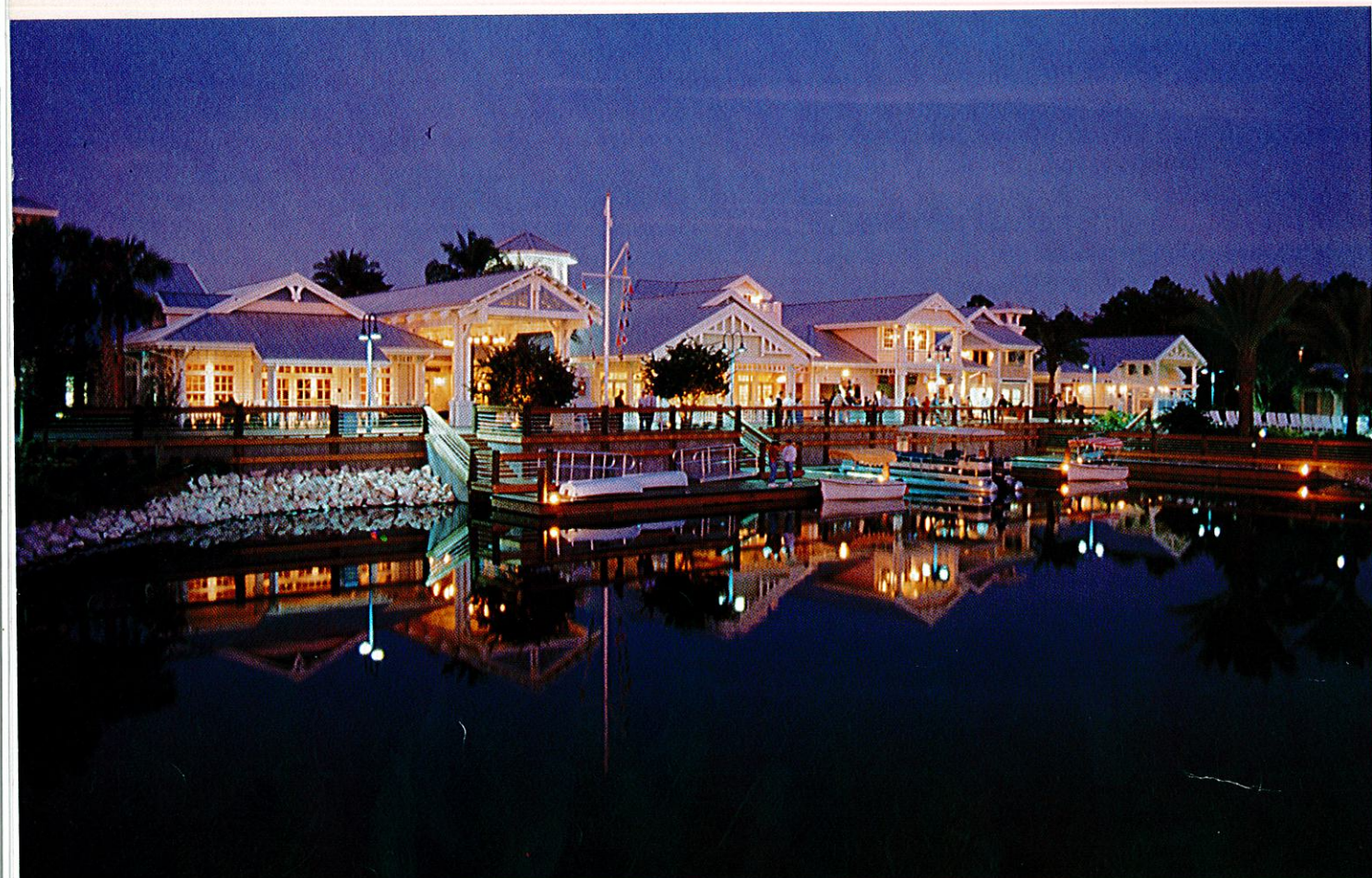
The Turtle Krawl is the retail and restaurant center of Disney's Old Key West Resort in Orlando.

Riverboat gaming is now legal in many states, including Illinois, Indiana, Iowa, Louisiana, Mississippi, Missouri, and Tennessee. While many of the casinos are simply riverboats, larger resort communities are also being planned around these facilities. For example, Grand Casinos, Inc., and the Gaming Corporation of America are planning a 2,000-acre resort community in a rural setting along the Mississippi River south of Memphis. The community will include a 70-acre lake surrounded by 4,200 hotel rooms and timeshare hous-