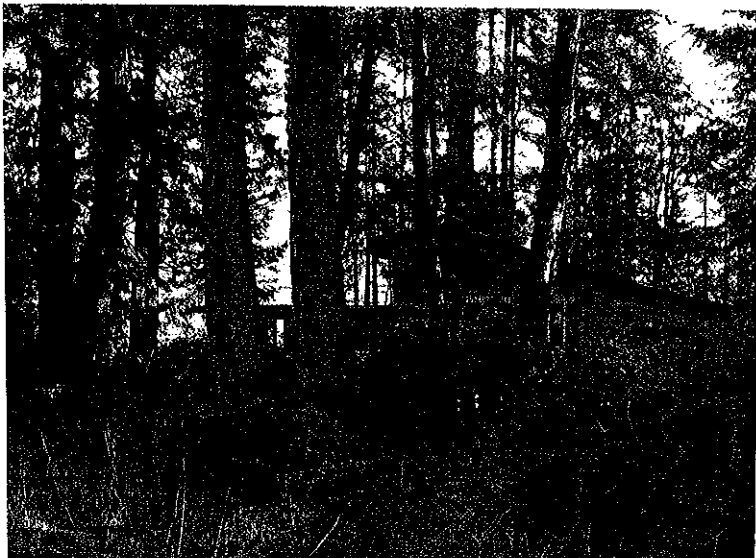
The building placement and design of Eco-rejuvenation Spa at Driftwood Farms, in Vancouver, British Columbia, Canada, was carefully nestled to preserve existing trees, the natural topography and sensitive areas of the coastal site as well as enhance bird habitat. These environmental design criteria will also help to reduce energy and irrigation requirements.

Oceans Blue Foundation - a Canadian environmental charity that was created in 1996 to help conserve coastal environments, internationally, through environmentally responsible tourism. It is the first organization in North America to focus on developing and promoting best practices and standards for all sectors of the tourism industry. www.oceansblue.org